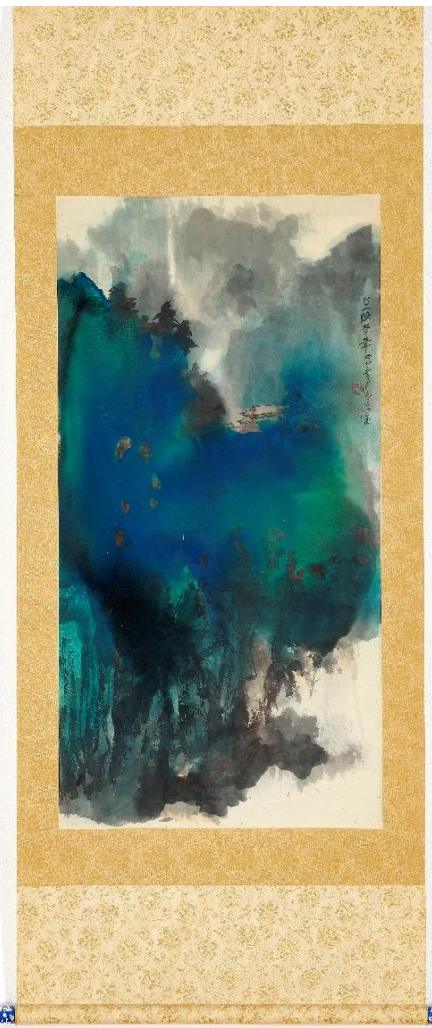
From A Distinguished Private Asian Collection ZHANG DAQIAN (1899-1983) Temple with Waterfall (COVER) Hanging scroll, ink and colour on paper 136.2 x 69.5 cm. (53 7/8 x 27 3/8 in.) Dated 1963

HK$60,000,000-80,000,000 / US$7,700,000-10,000,000