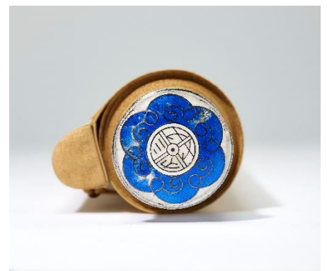
Tailor-made cloisonné scroll knob specially designed by Da Feng Tang, Zhang Daqian's studio